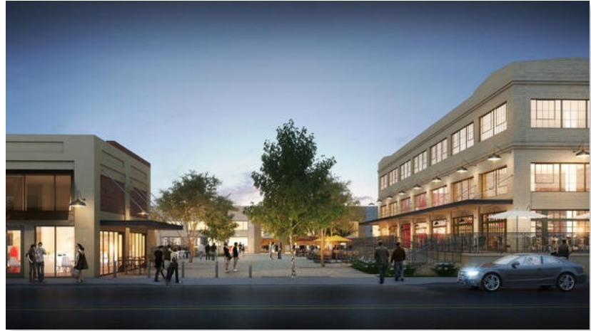
Rendering of City Market South provided by LENA Group