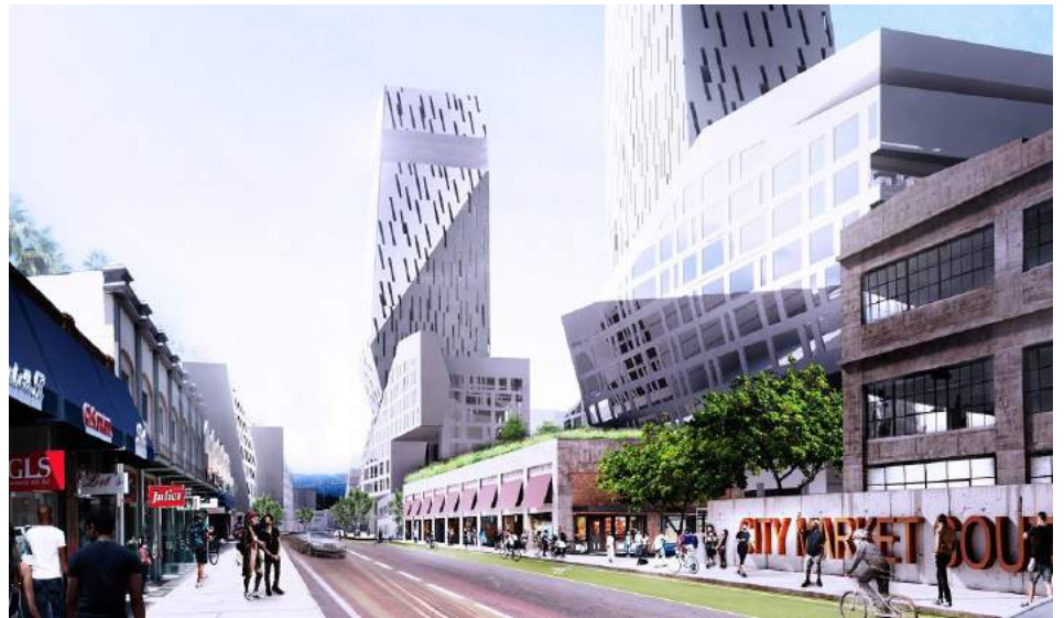
City Market North and South projects

The Southern California Flower Market, 755 Wall St., a longtime Fashion District institution is seeking an upgrade to its current facility. The property occupies a 3.8-acre site bounded by 7th, 8th, Wall and Maple streets. The existing market, situated in a hodge-podge collection of modest industrial buildings, is described by the owners as functionally obsolete.