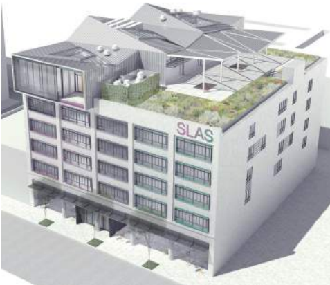
Norton Building by Lynch Eisinger Design Architects

Both structures date to the early 20th century, and offer large floor plans and high ceilings that attract creative tenants. The surrounding neighborhood, which is already seeing a gradual influx of multifamily residential development, currently has a dearth of Class-A creative office space.