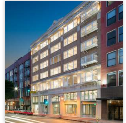
Grether & Grether Lofts, 730 S. Los Angeles St.