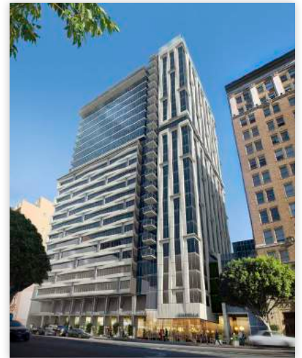
732 S. Spring St.

The building was designed by MVE + Partners and features a fabric weave pattern inspired by the Fashion District.