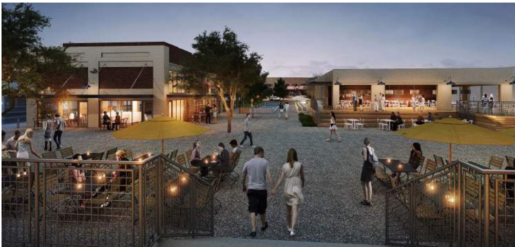
City Market South, 11th and San Julian streets

openings on both 11th and San Julian streets. Most of the property is leased. Current tenants include the architecture firm MASA Studio, developer LENA Group, clothing brand LoveStitch and visual effects company Drive Studios. Ground-level food and beverage venues include Cognoscenti Coffee and the Bologna-inspired restaurant Rossoblu. The Russo Brothers movie studio, AGBO and a cocktail bar have also been announced.