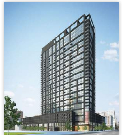
Fashion District Residences by HPA Urban Architecture

Extensive greenery wraps the project at ground level and around its amenity decks. A landscaped pedestrian paseo cuts along the property line, potentially providing a link to the adjacent Santee Village courtyard. Upper levels will also feature a swimming pool, a barbeque area, a private dog park and a skyline observation space.