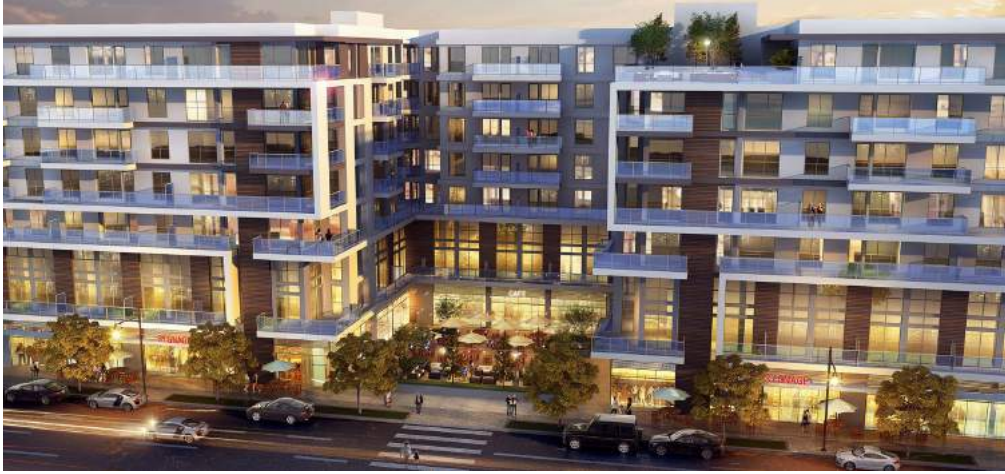
Main Street Park & Mixed-Use Project, 11th and Main streets