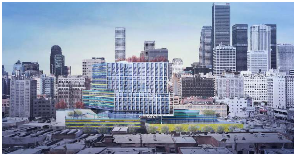
Southern California Flower Market Renderings, 755 Wall St.

Renderings of the project, designed by Los Angeles-based architecture firm Brooks + Scarpa, portray a boxy mid-rise structure featuring grid-pattern windows with yellow and green horizontal elements. A public paseo will cut through the property at ground level. Plans also call for flower-themed murals across the development. Construction could begin in approximately two years.