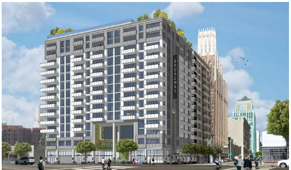
Broadway Lofts, 955 S. Broadway

Developer Nepak Capital Property Investment, LLC is redeveloping the three-story industrial building at 1320 S. Main St. The top two floors of the building will be converted into four joint live/work apartments, while retaining the existing retail space.