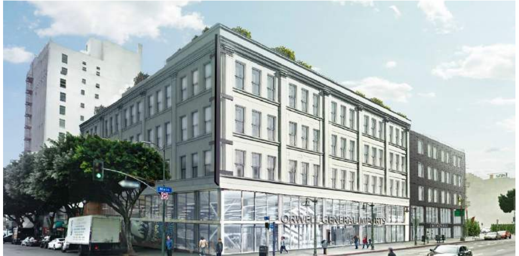
Rendering for former Dearden's building, 7th and Main streets

Urban Offerings, in partnership with ESI Ventures, is expanding its vision of a creative office campus in Downtown Los Angeles. Plans were announced to construct a 250,000-square-foot office campus in the Fashion District. The project includes the Norton Building, a five-story structure located at 755 S. Los Angeles St., and the 100-year-old Dearden's Building, a four-story edifice at 7th and Main streets which operated as the Dearden's department store until last year.